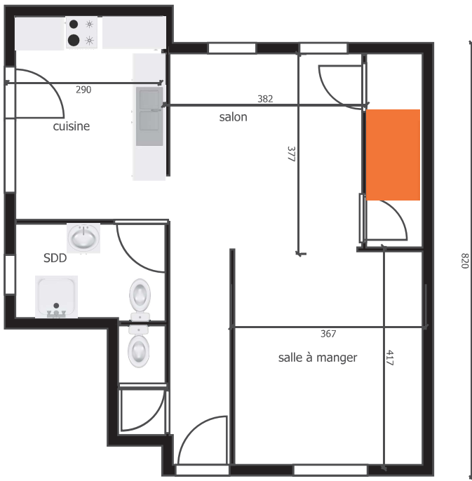
REZ DE CHAUSSEE